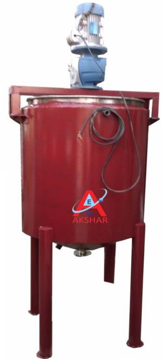
Jacketed Agitator Tank