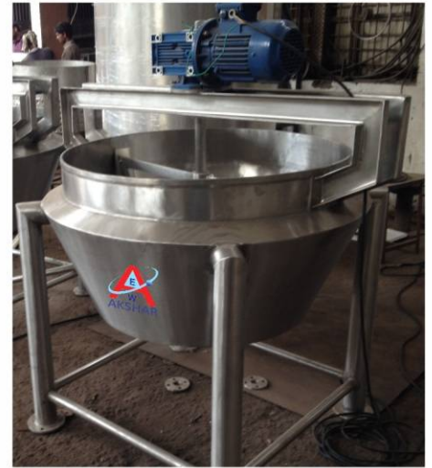
30L - 2000L