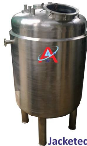
Jacketed Storage Vessel