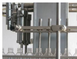
Automatic 6 Head Filling Machine Automatic 4 Head Filling Machine