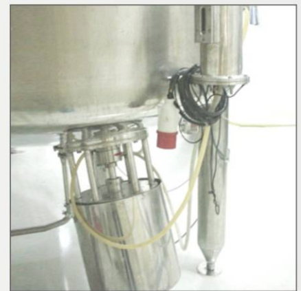
Bottom Mounted Homogenizer