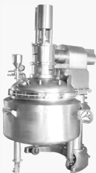
Contra Rotary Type Agitator based for toothpaste.

Teflon Floating Scrapper to scrape off product from the wall of vessel, Thus Reducing Cleaning time & Product wastage.