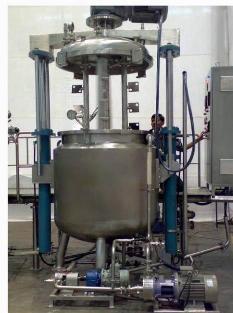
Intensive mixing by Special Semi-Contra Design Anchor, Stirrer with Variable Speed Drive. Avoiding Dead Zones.